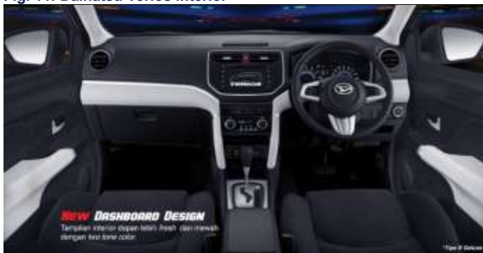
Fig. 11: Daihatsu Terios interior