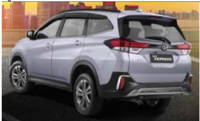
Fig. 10: Daihatsu Terios facelift