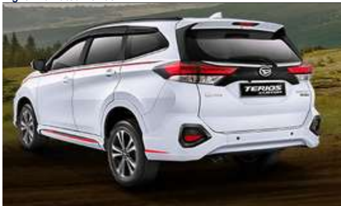
Fig. 9: Daihatsu Terios