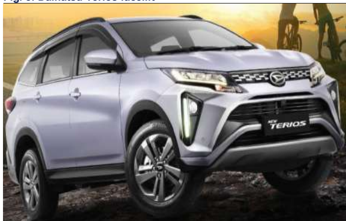
Fig. 8: Daihatsu Terios facelift