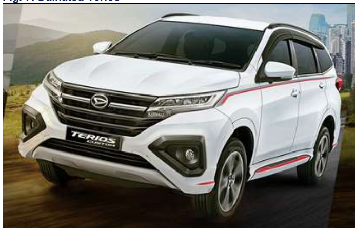
Fig. 7: Daihatsu Terios