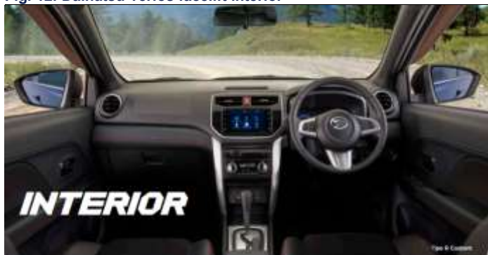
Fig. 12: Daihatsu Terios facelift interior